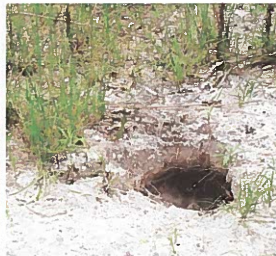
Gopher Tortoise Burrow

The gopher tortoise is protected under Florida law, Chapter 68A-27 of the Florida Administrative Code. Protect yourself and this imperiled species. Learn more at MyFWC.com/GopherTortoise or contact the nearest office of the FWC.