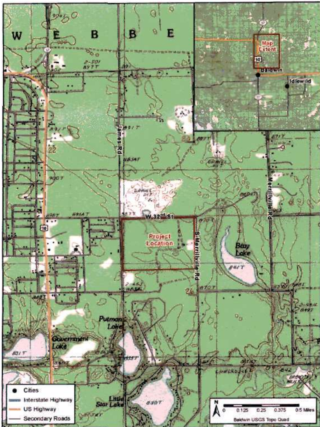
Figure 1. Project Location, Baldwin MI